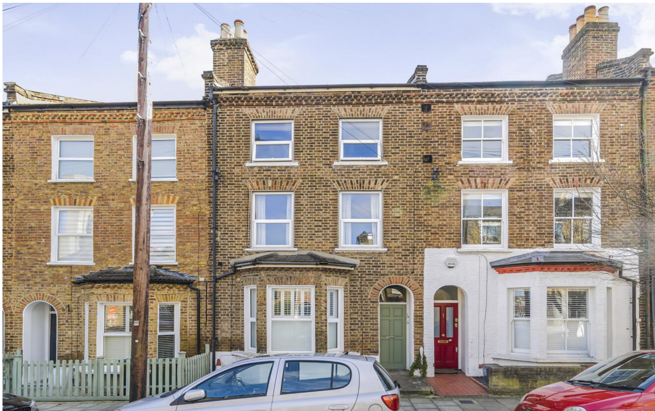
Rommany Road, West Norwood, SE27