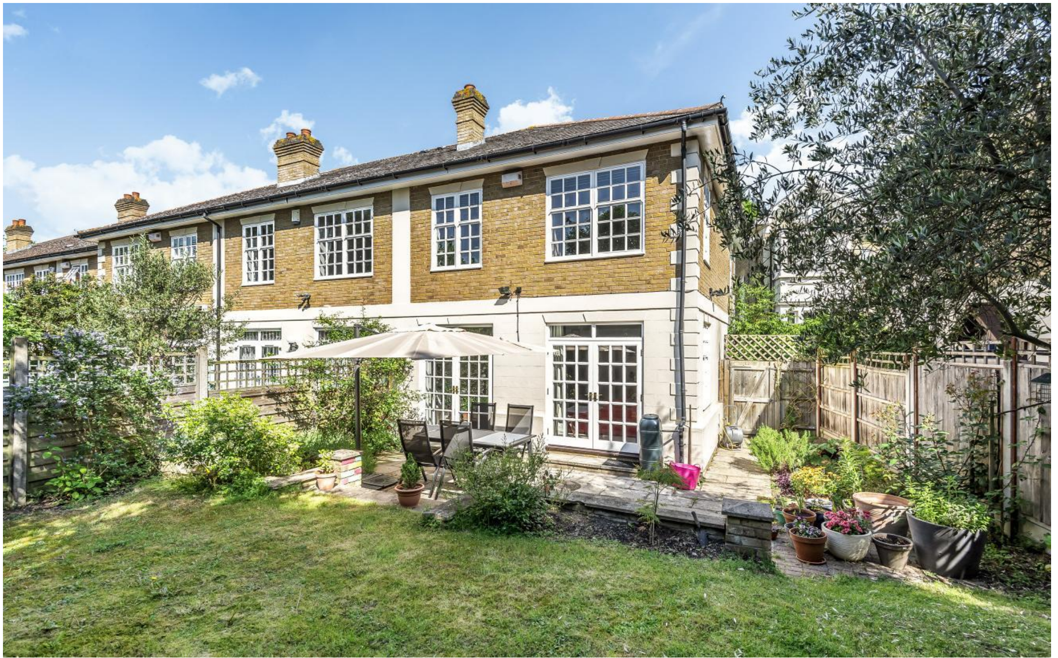
Spenser Mews, West Dulwich, SE21