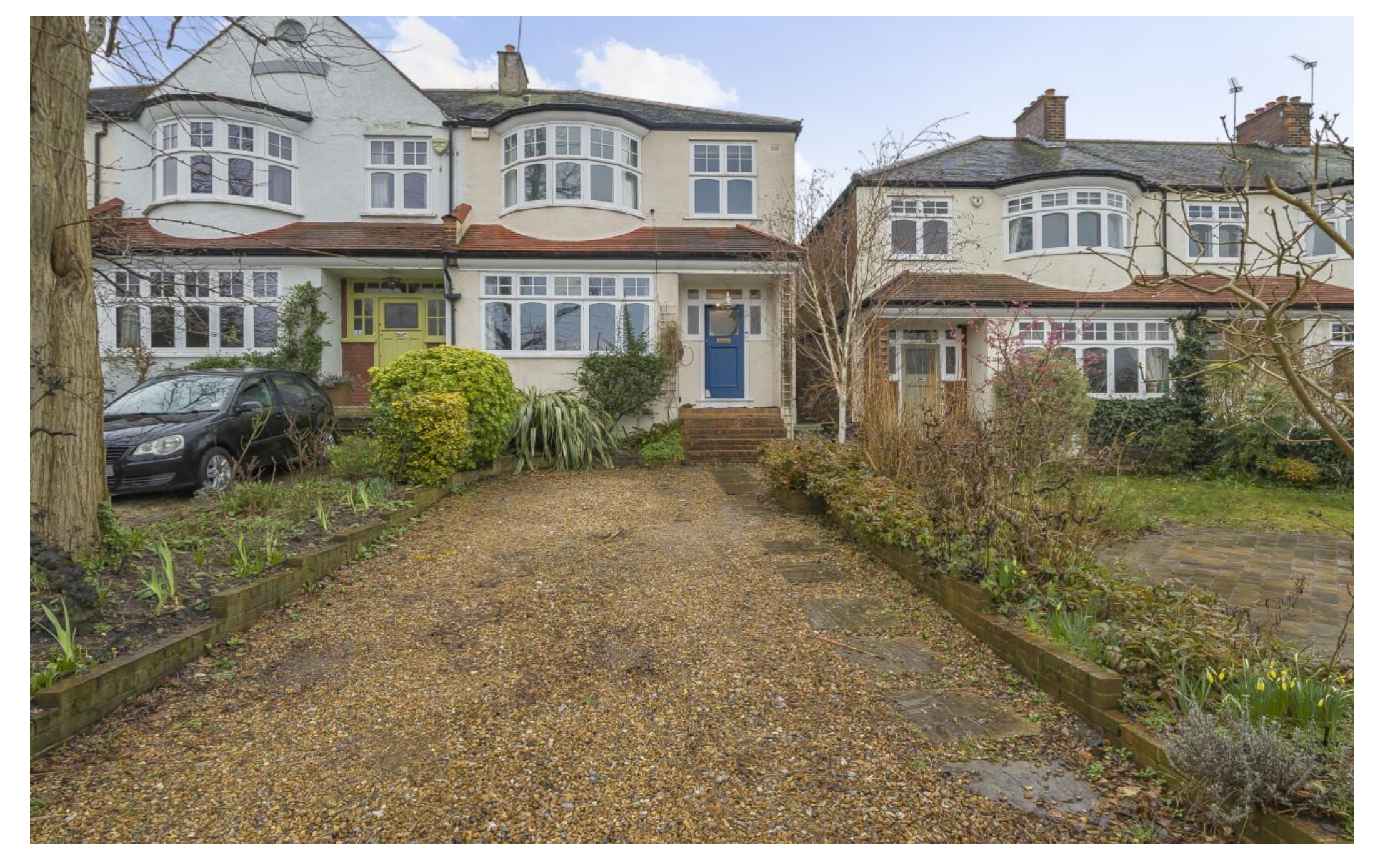
Rosendale Road, West Dulwich, SE21