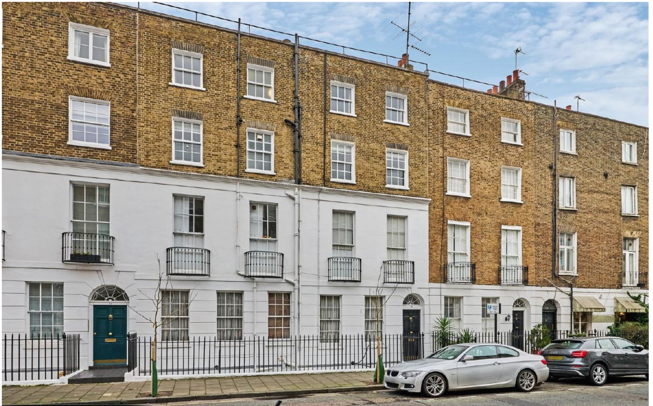
Upper Montagu Street, Marylebone, W1H