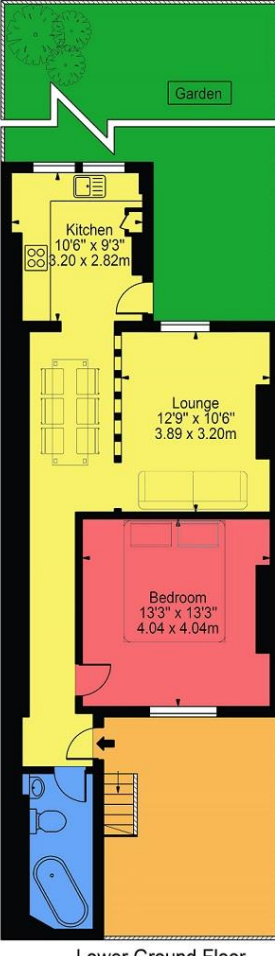
Lower Ground Floor For Illustration Purposes Only - Not To Scale

This floor plan should be used as a general outline for guidance only and does not constitute in whole or in part an offer or contract. Any intending purchaser or lessee should satisfy themselves by inspection, searches, enquiries and full survey as to the correctness of each statement. Any areas, measurements or distances quoted are approximate and should not be used to value a property or be the basis of any sale or let.