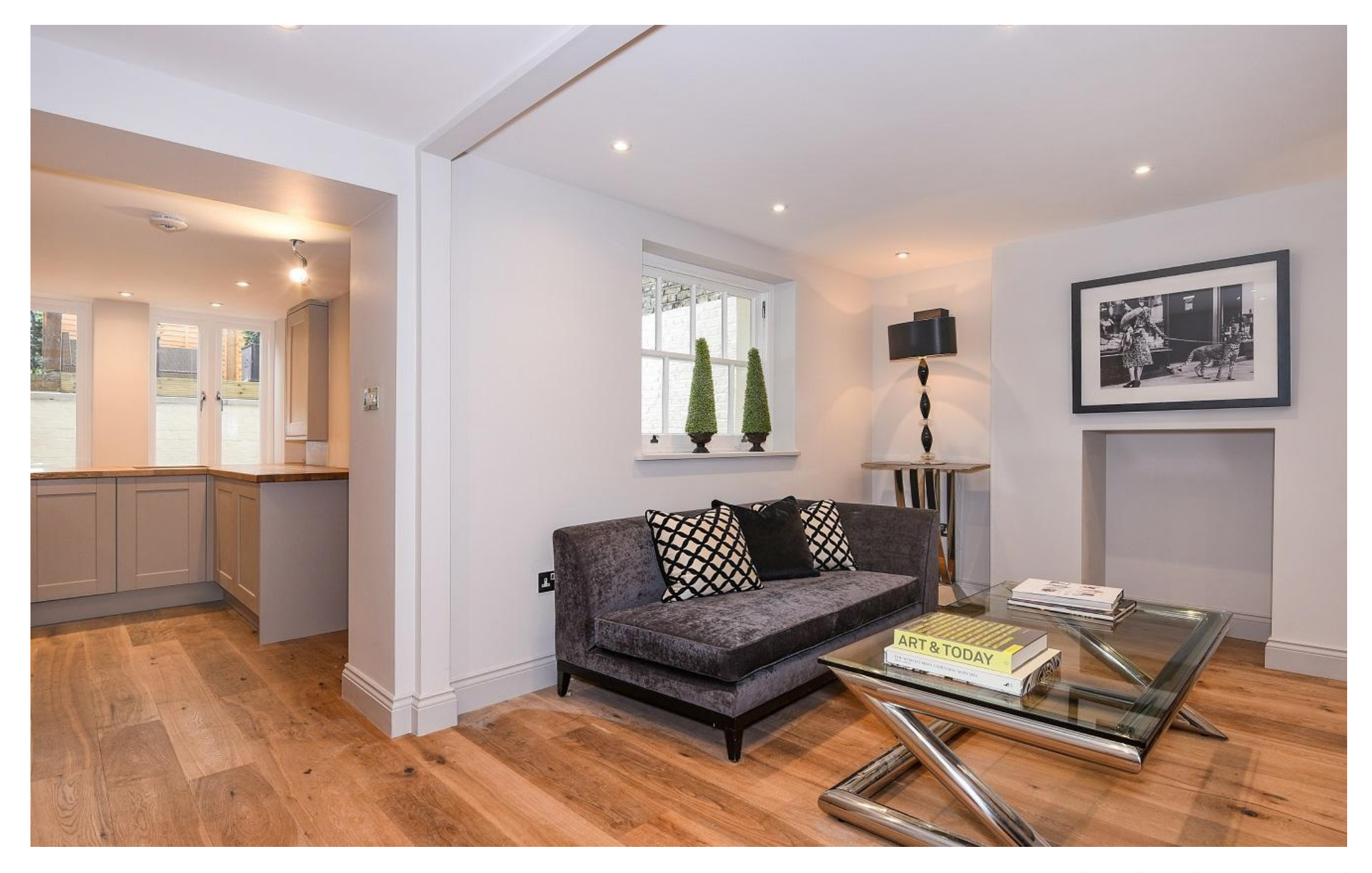
Cunningham Place, St Johns Wood, NW8