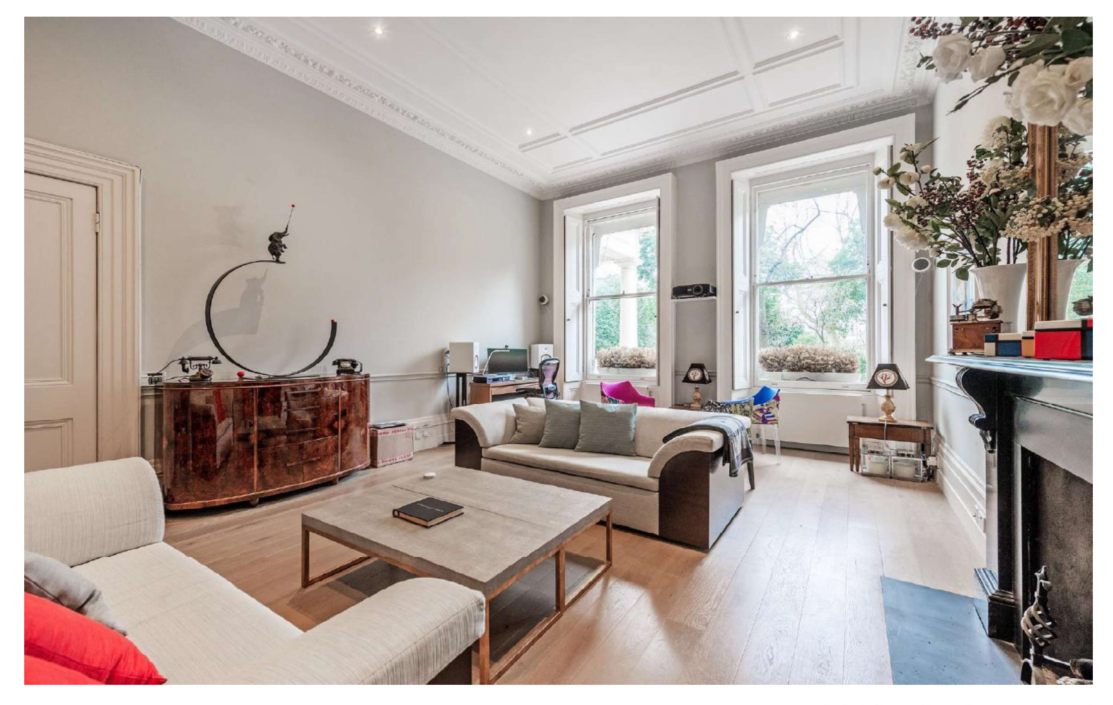
Queen's Gate Gardens, South Kensington, SW7