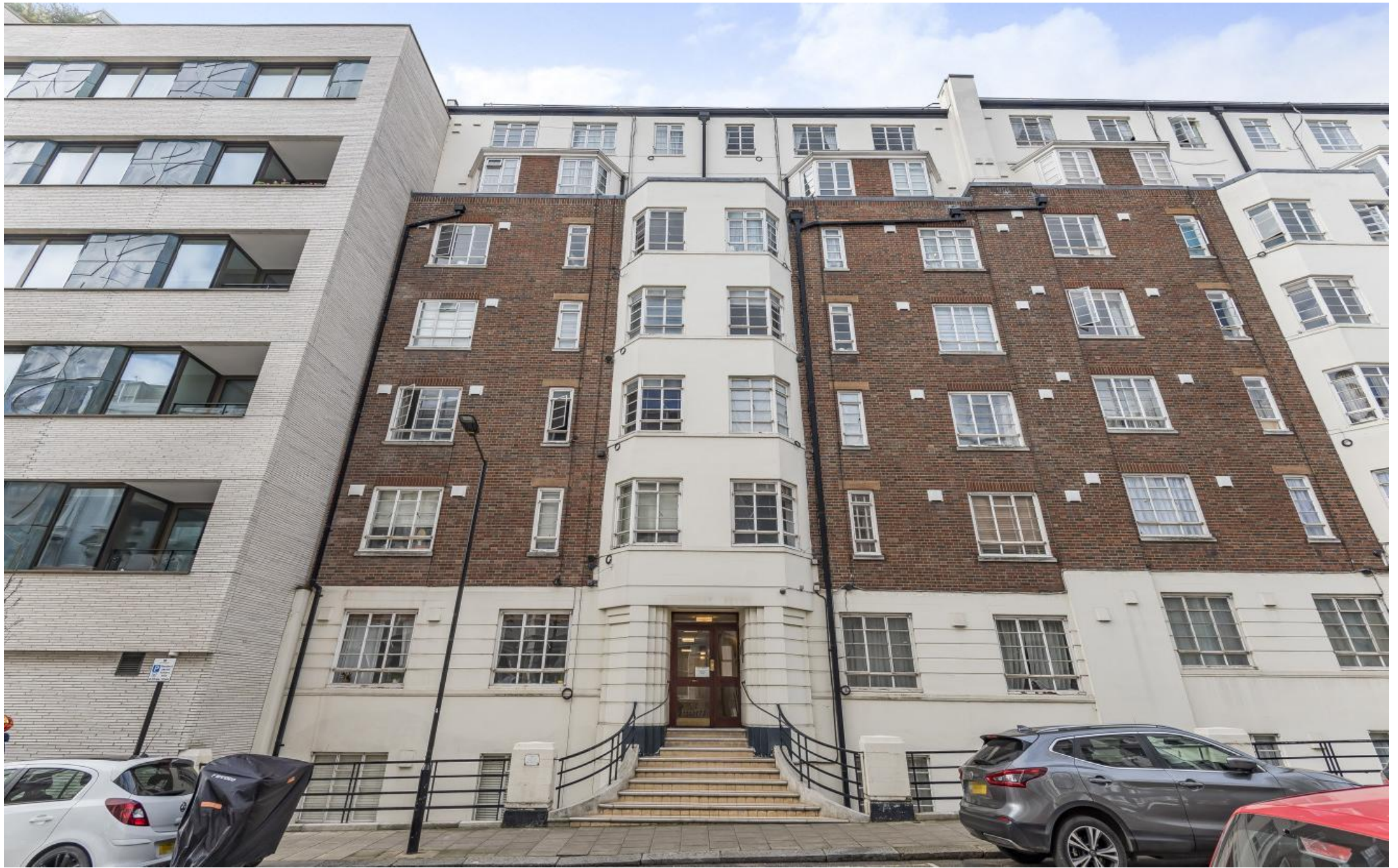
Hatherley Grove, Bayswater, W2