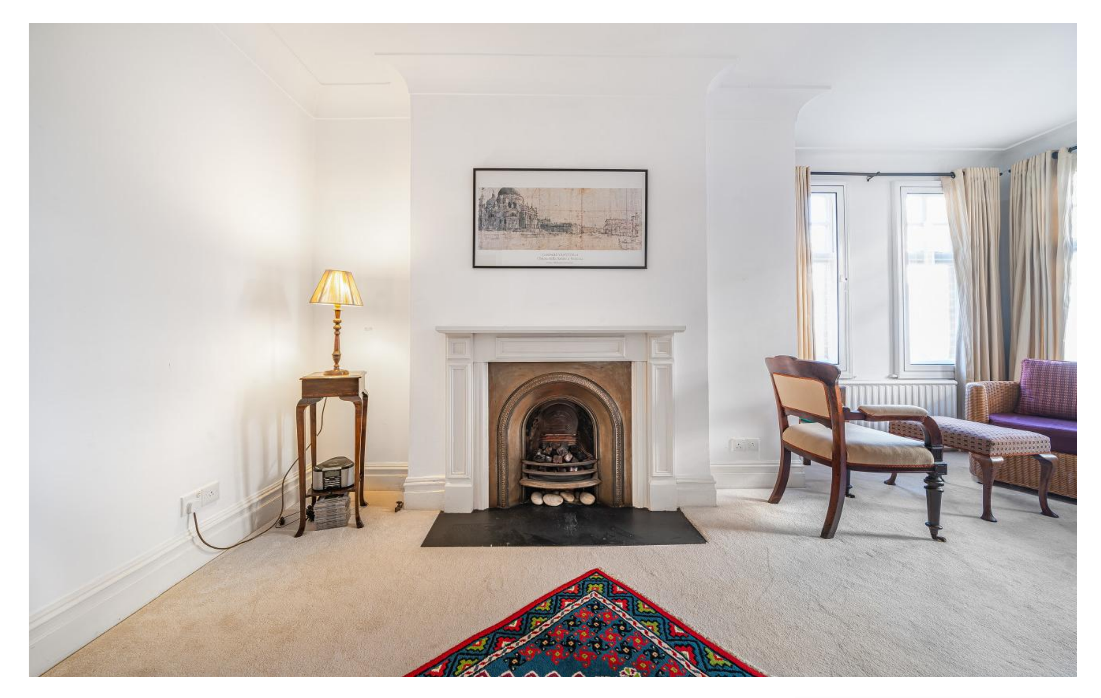
Hamlet Gardens, Hammersmith, W6