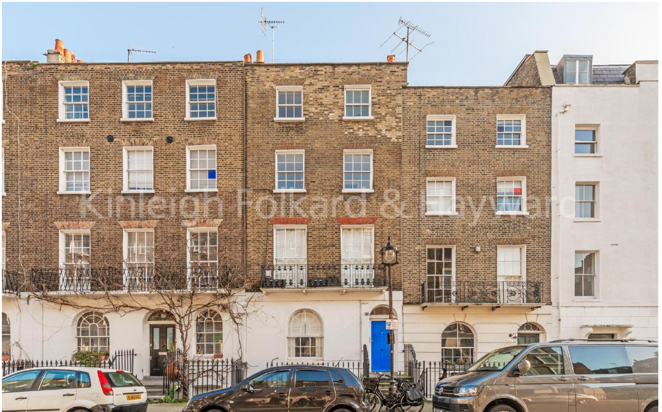
Balcombe Street, Marylebone, NW1