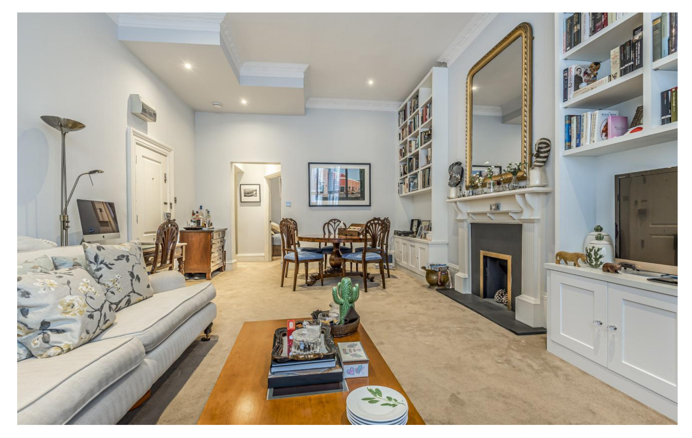
Maclise Road, Brook Green, W14