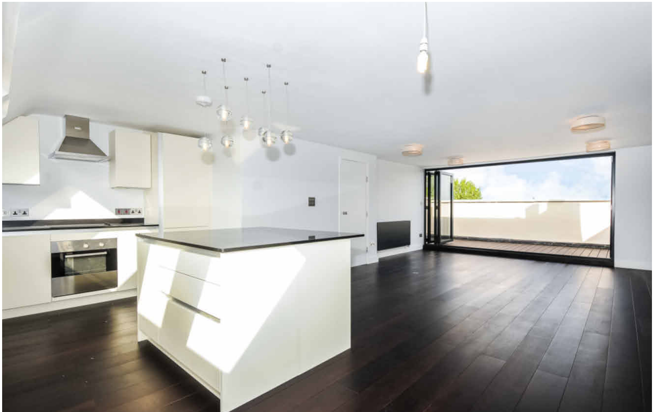
England's Lane, Belsize Park NW3