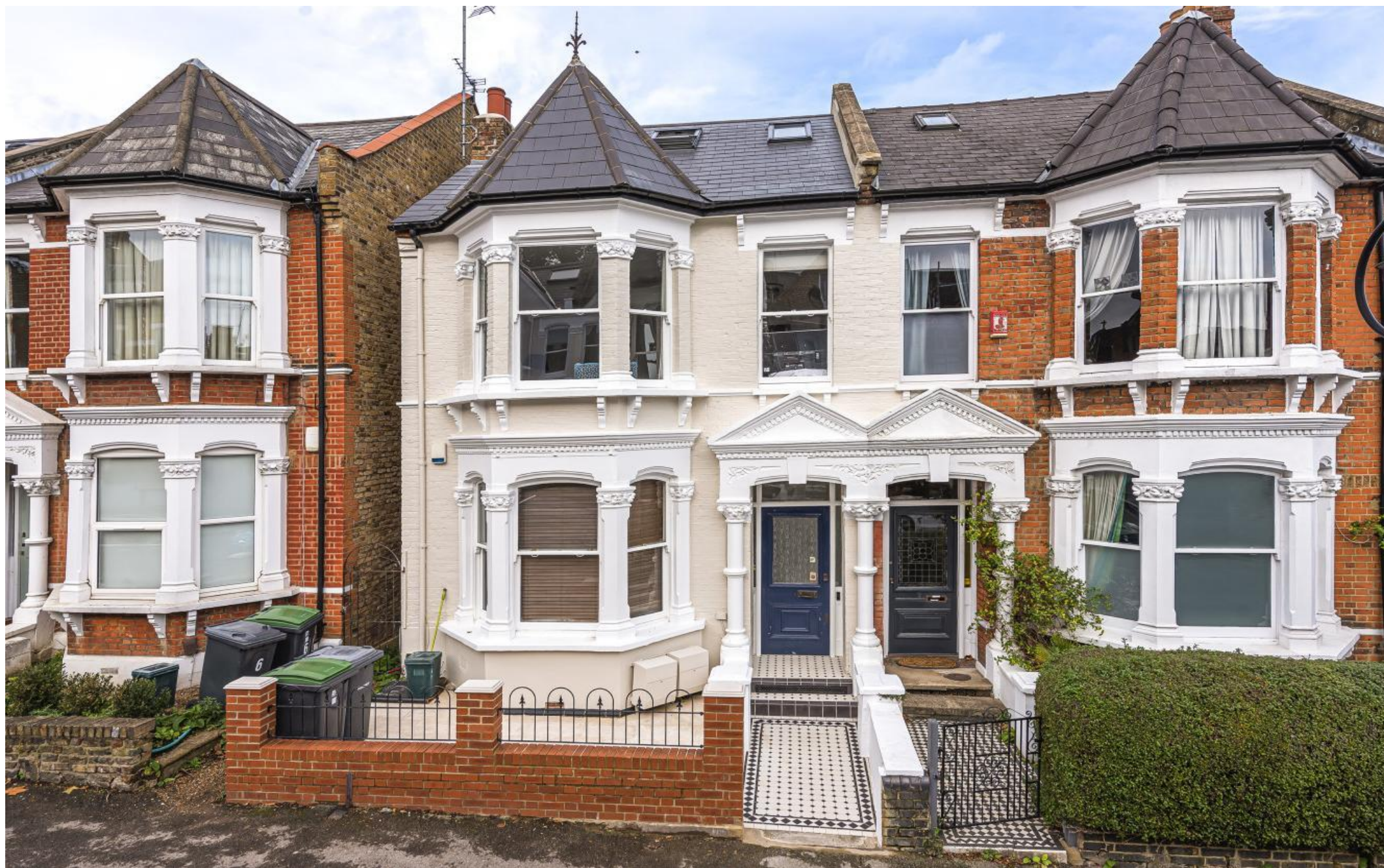
Dashwood Road, Crouch End, N8