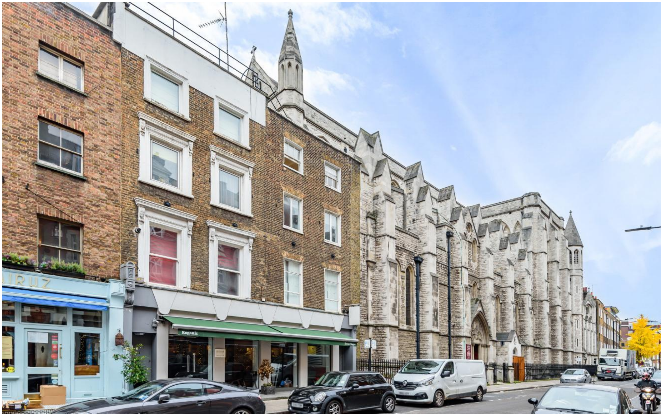
Blandford Street, Marylebone, W1U