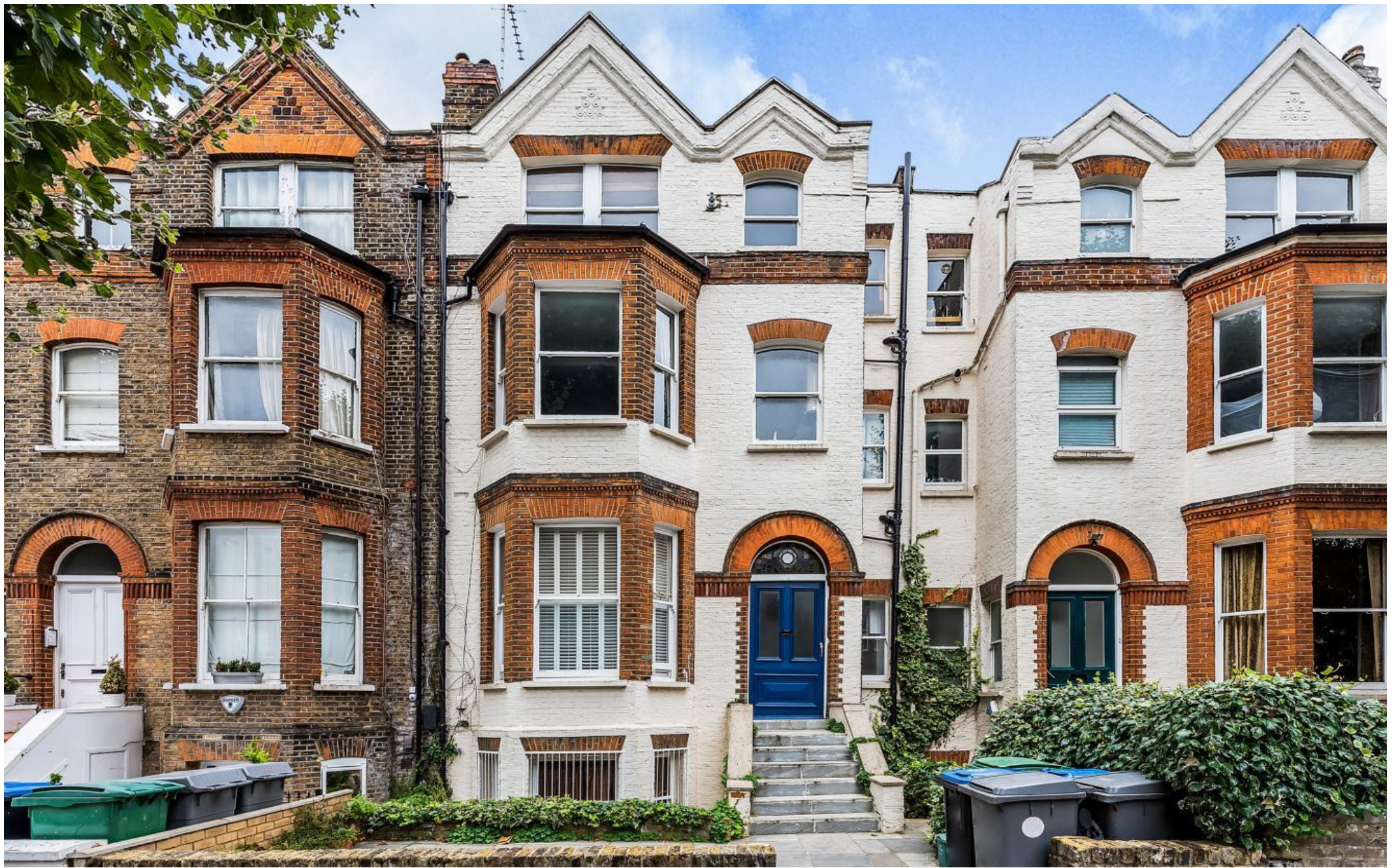
Brondesbury Villas, Queens Park, NW6