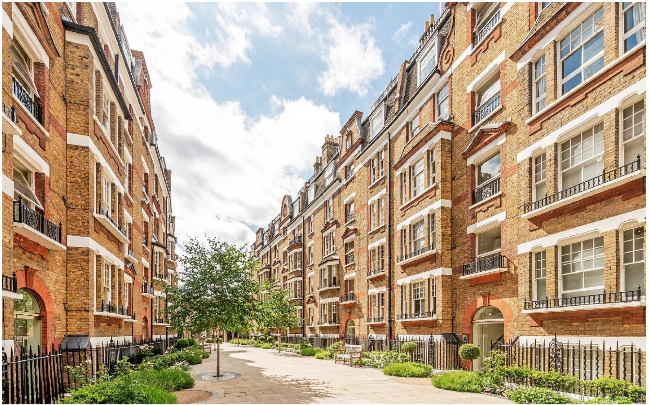
Walton Street, Knightsbridge, SW3