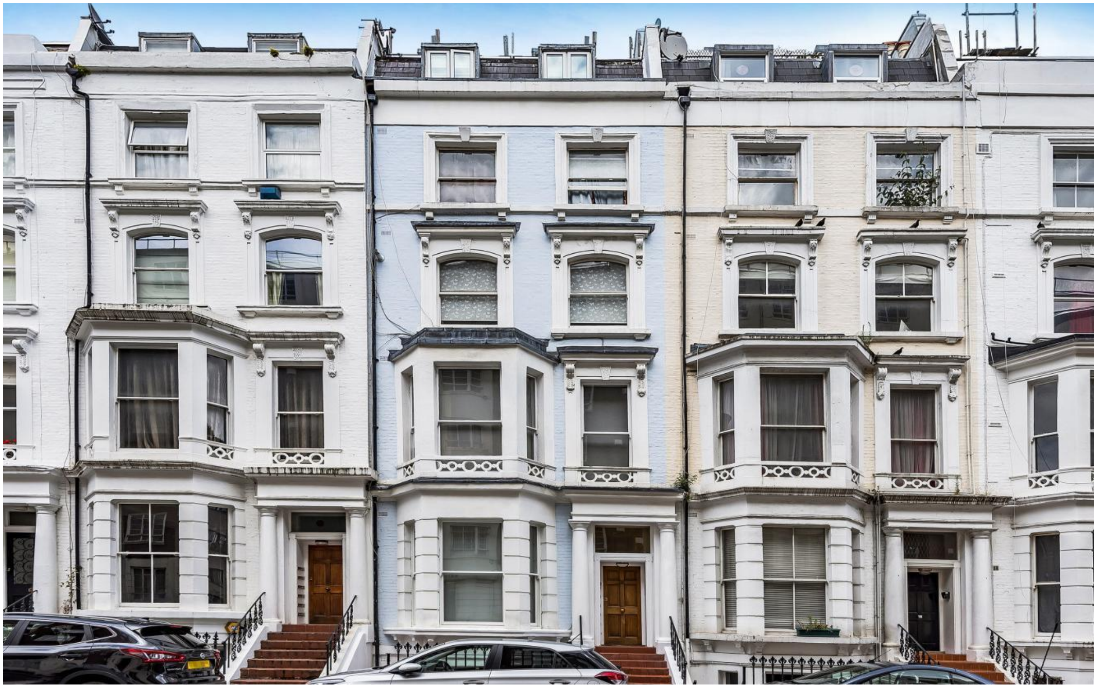
Hatherley Grove, Bayswater, W2