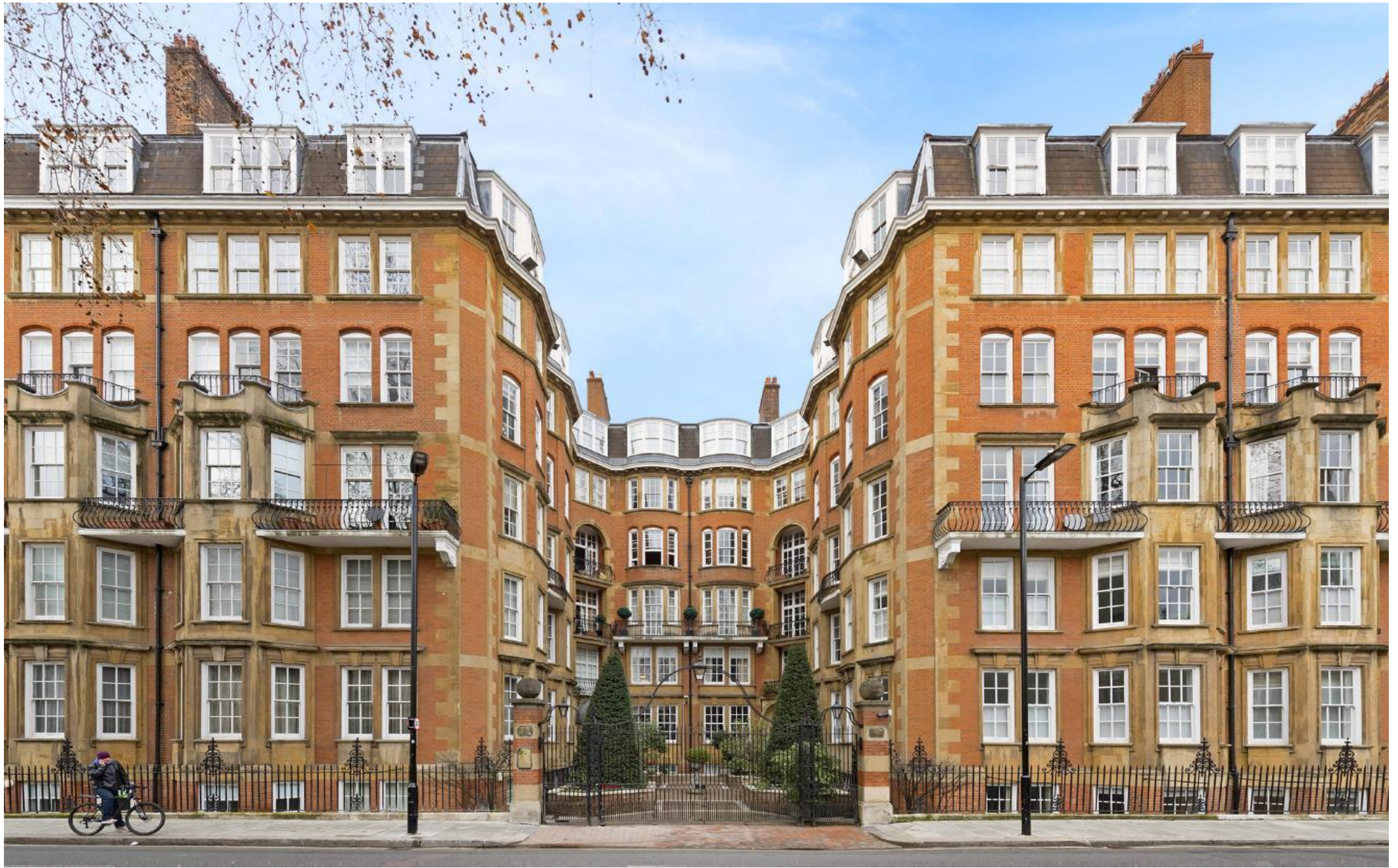
Palace Court, Bayswater, W2