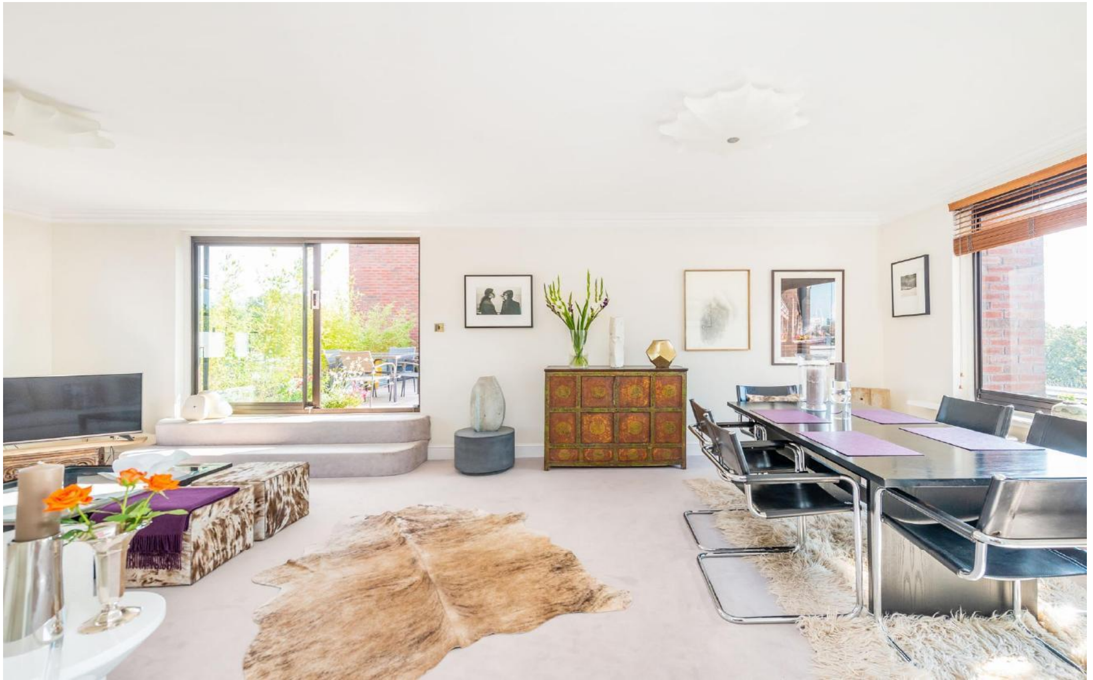
Cameret Court, Holland Park, W11