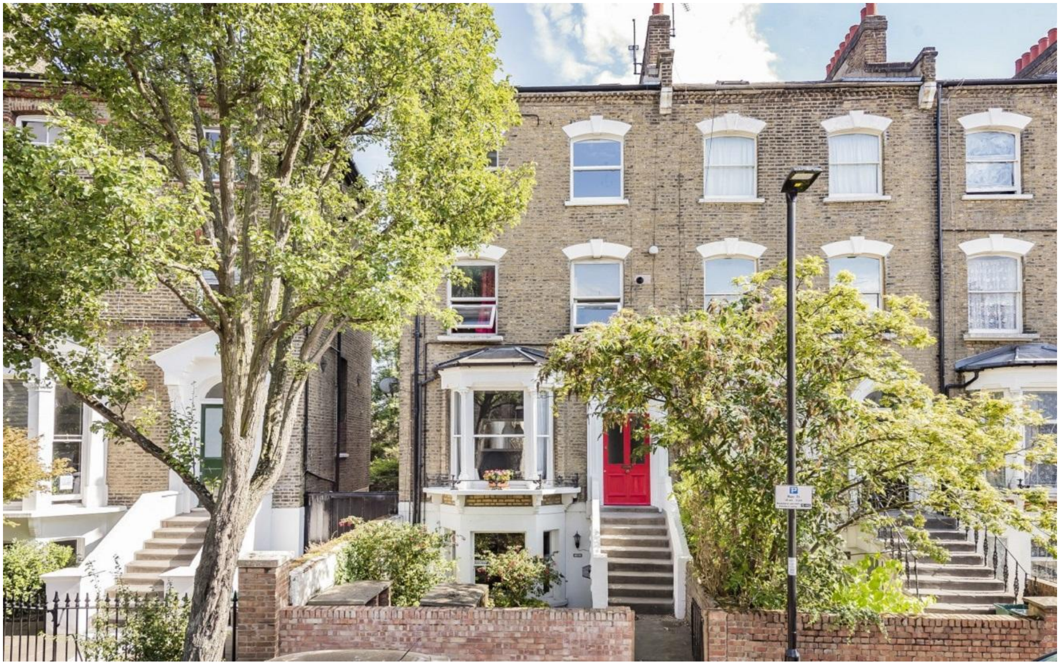
Ashley Road, Upper Holloway, N19