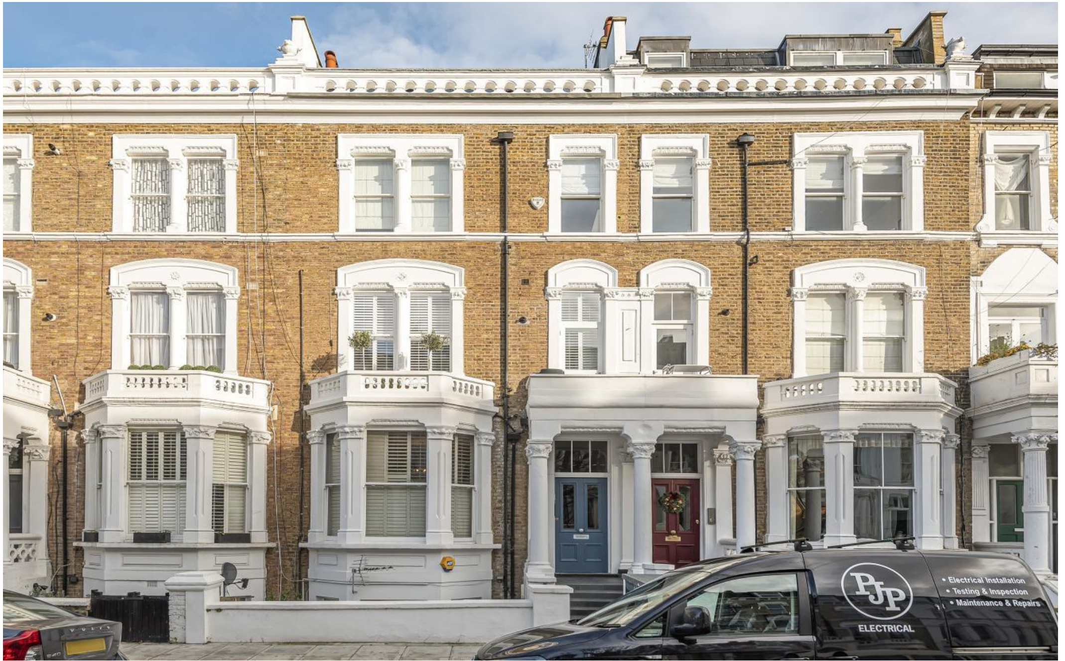
Sinclair Road, Brook Green, W14