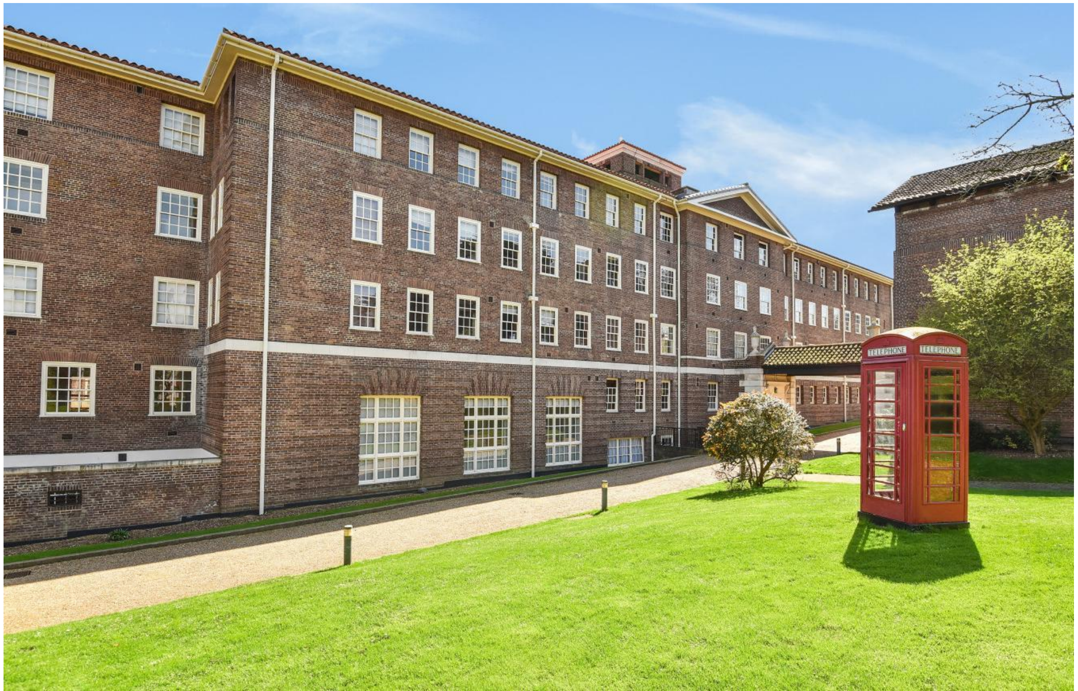
Scott Avenue, Putney, SW15