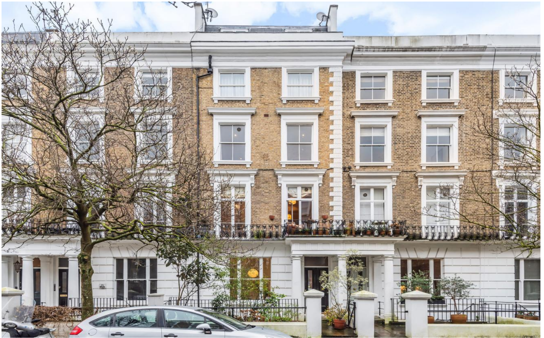
Sunderland Terrace, Bayswater, W2