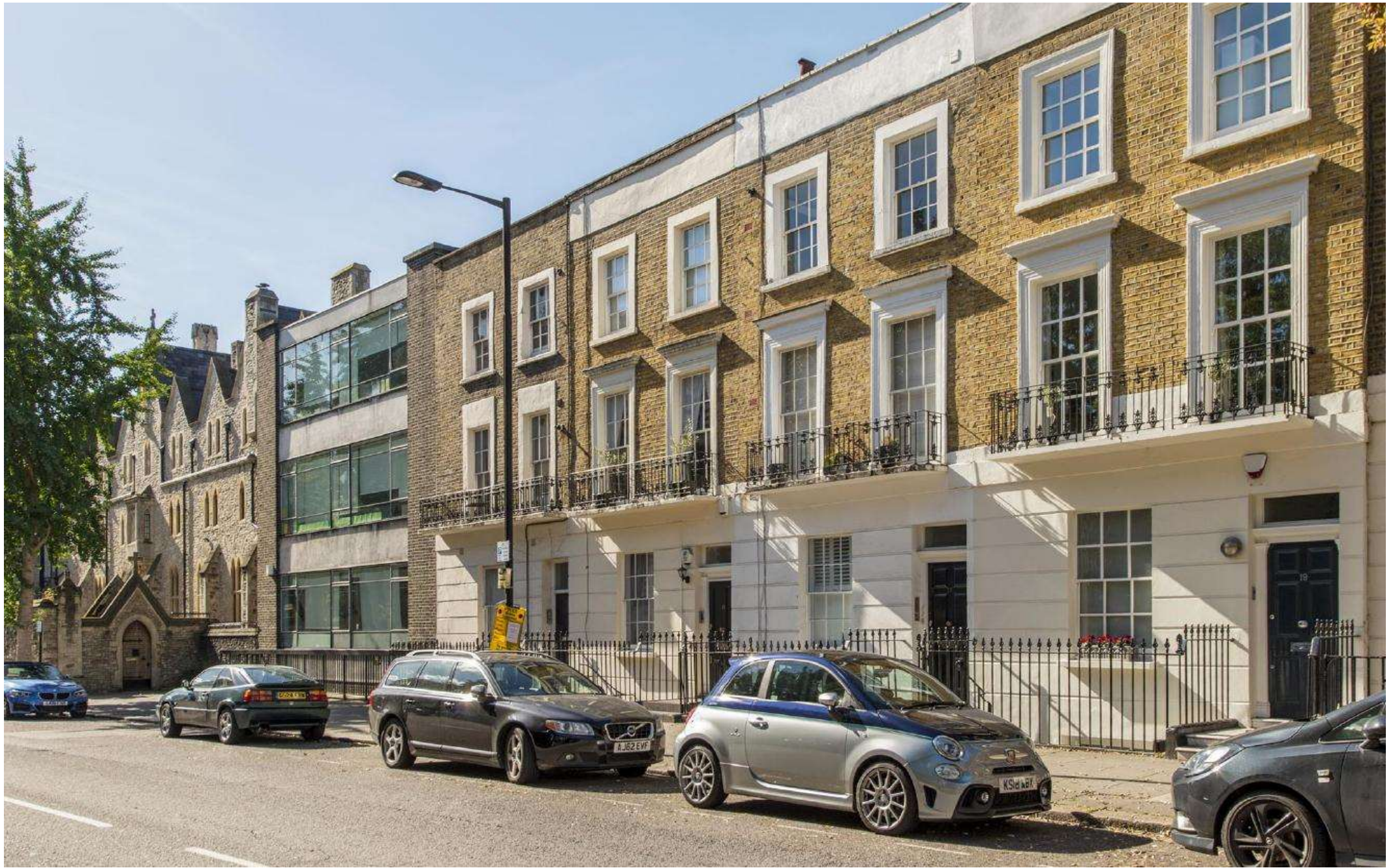
Harewood Avenue, Marylebone, NW1